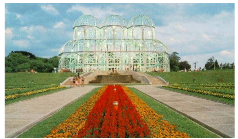
Credit cards give us goods quickly, the fax machine gives us the message quickly – the only thing left in our Stone Age is central governments. -- Jaime Lerner, former mayor of Curitiba

Citizens, the ancient Athenians realized, are the best people to identify priorities for action in their own cities. If cities are to become more sustainable, people must take action in the neighborhoods where they live. Most of the urban environmental success stories came about when citizens identified various problems and the links between them in order to pin down cause and effect. A charismatic mayor in Curitiba, for instance, saw that chaotic development and poor public transportation conspired to worsen air pollution: car use increased as buildings sprouted far from bus stops. By winning popular backing for a new bus system, he demonstrated that when citizens understand such connections, they often support or even demand change. -- Molly O'Meara