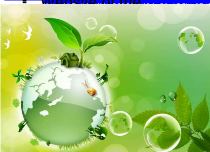
Figure 4: An artistic view of a ideal environment.