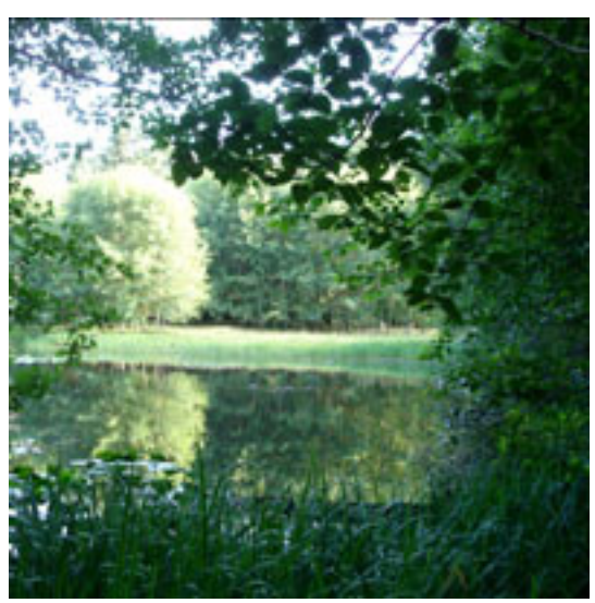
Phase I (March 1999)

involved the private purchase of 25 acres of land near Shawnigan Lake in order to secure it from future development. The former owner was eventually convinced that the proposed development of a vibrant, environmentally friendly community would be a very positive use of the land, and ended up donating a third of the original asking price. A group of approximately 14 people came together as the Creation Team , taking responsibility for the ongoing design and development process of the community project.