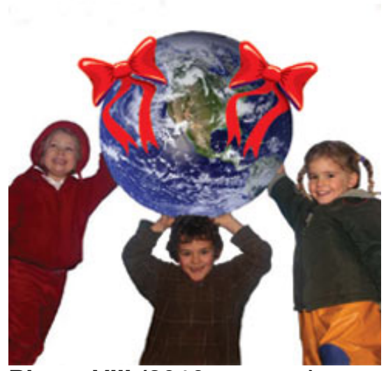
Phase VIII (2010-present) [

begins with the creation of a new ownership entity (developed with the assistance of the FOG project). In July 2007, we established O.U.R. Ecovillage Cooperative, incorporated with five membership classes. The co-operative was created for the purpose of providing a legal model for the collective ownership of the land and to provide a governance structure that will bring together all the earlier established organizations at O.U.R. and all interested parties. The cooperative has begun to implement this plan through the creation of a business plan in order to secure financing for the purchase and further development of the property.