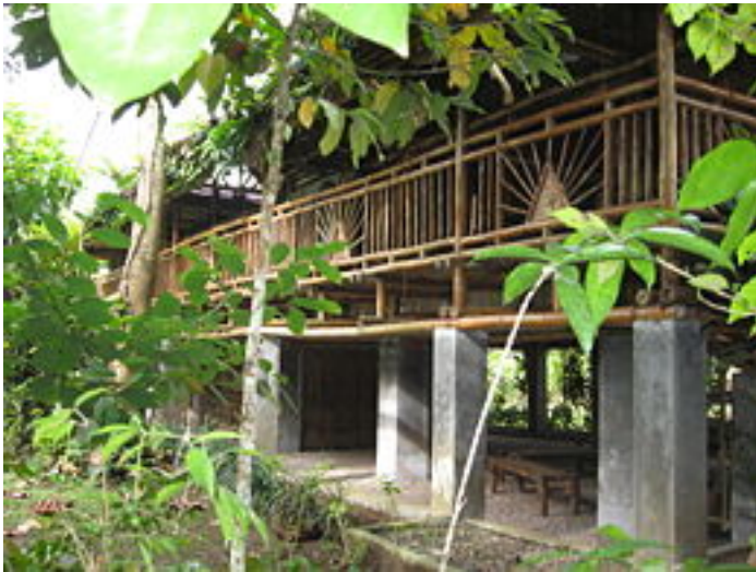
C.E.L.L.'s Brandon Hall shows what Pintig's community building might look like once it's built.