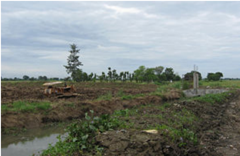
□ Pintig's 10-acre property was a rice field before recent excavation to create water