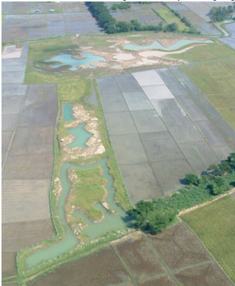
An ariel view of Pintig Ecovillage land (top is being financed by grants, the team will develop, and, that is the area